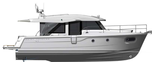
Sedan version profile