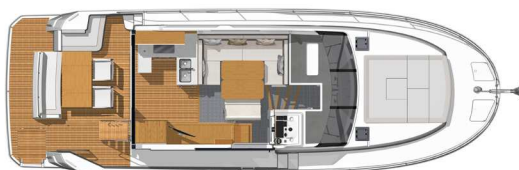
Upper deck with tables unfolded

Stairs in the cockpit for the Flybridge version only