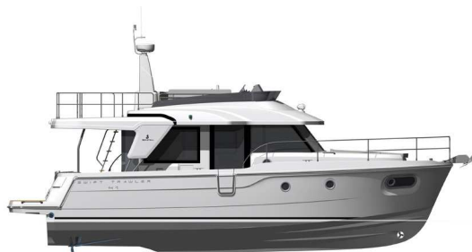
Flybridge version profile